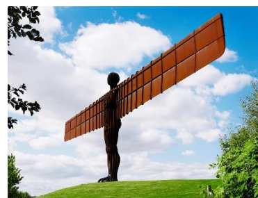
The Angel of the North